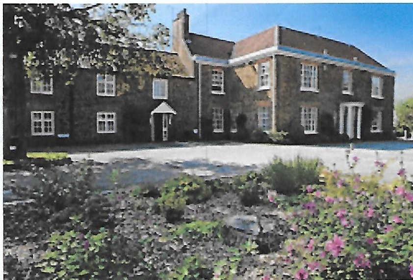
Knights Hill Hotel & Spa, South Wootton Kings Lynn, Norfolk PE30 3HQ